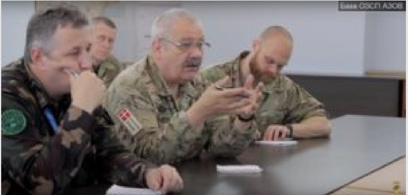
The meeting of Azov Regiment with representatives of NATO